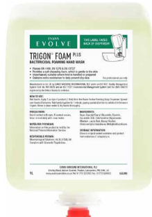
Evans Trigon Foam Plus A063BEV (6 X 1L)

Effective foam soap for thorough hand cleaning.