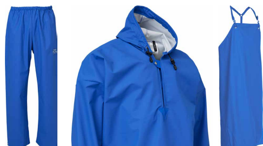
ELKA Waterproof and Chemical Resistant Clothing

Light and comfortable safety wellington in range of colours featuring steel toe cap and made from super flexible PU.