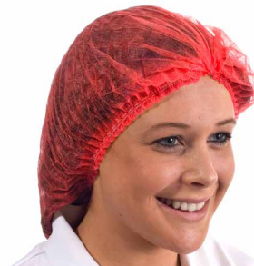
Mob Caps - Double Stitched Mob Cap

Durable gloves for reliable protection during food handling. We can supply Nitrile gloves in a wide range of 16 colours.