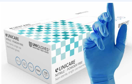
Unicare Blue Nitrile Gloves

Durable gloves for reliable protection during food handling. We can supply Nitrile gloves in a wide range of 16 colours.