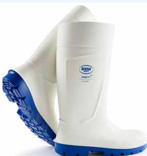
Bekina Steplite EasyGrip S4 White PU Safety Wellington

Light and comfortable safety wellington in range of colours featuring steel toe cap and made from super flexible PU.