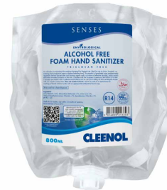
Senses Alcohol Free Sanitiser Foam 800ml Pouches

Effective foam soap for thorough hand cleaning.